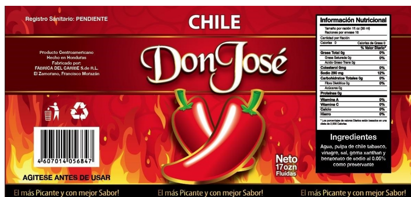
Figure 1 - Example of Spanish label complying with RTCA 67.01.07:10