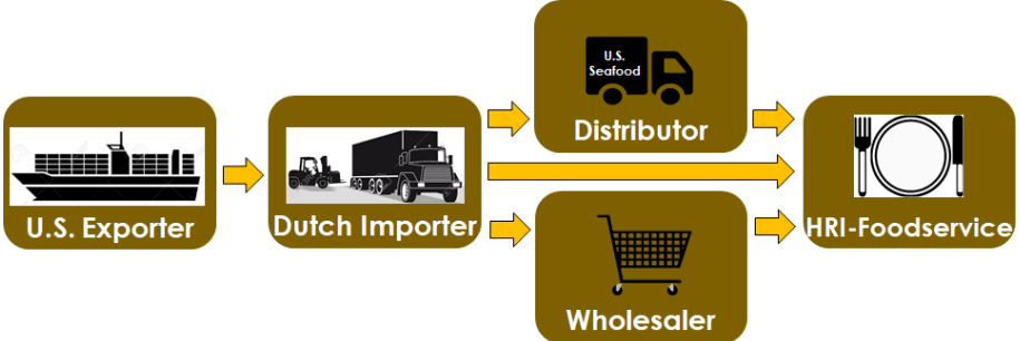
Figure 1. Distribution Channel Flow Diagram

The latter prefer to have products delivered since this will save them time. Delivery of pre-ordered products also ensures that products arrive on time and in the ordered quantities. High-end hotel and restaurant players prefer to buy fresh products like bakery, produce, seafood, meat, wine and dairy products from specialized distributors. The benefit lies in the possibility to have tailor-made orders and the interpersonal relationship. Beer and non-alcoholic beverages are generally bought directly from breweries. For shelf stable grocery products, like spices, nuts, sauces, cooking ingredients and also distilled spirits and cider, hotels and restaurants turn to wholesalers.