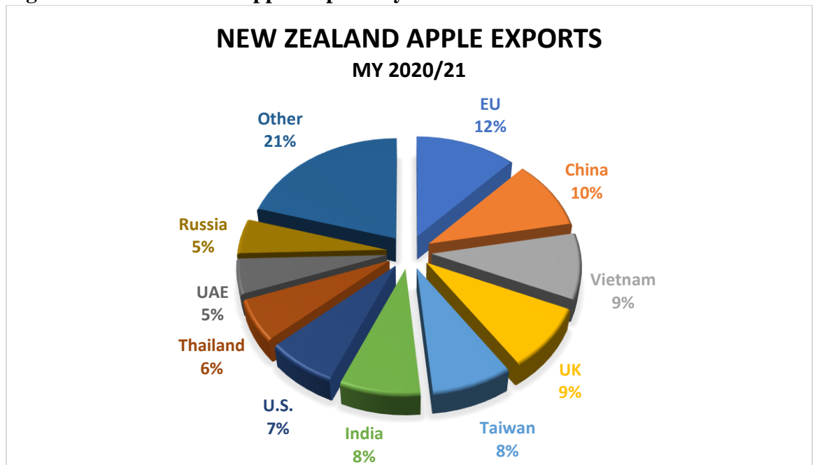
Figure 3: New Zealand Apple Exports by Destination

In general, New Zealand apple exports are very well diversified across a range of markets, which contrasts with New Zealand agricultural exports in general which are heavily focused on China (accounting for nearly 40 percent of total New Zealand agricultural exports by value last year). The EU is the largest market, but its importance has been diminishing for a number of years.