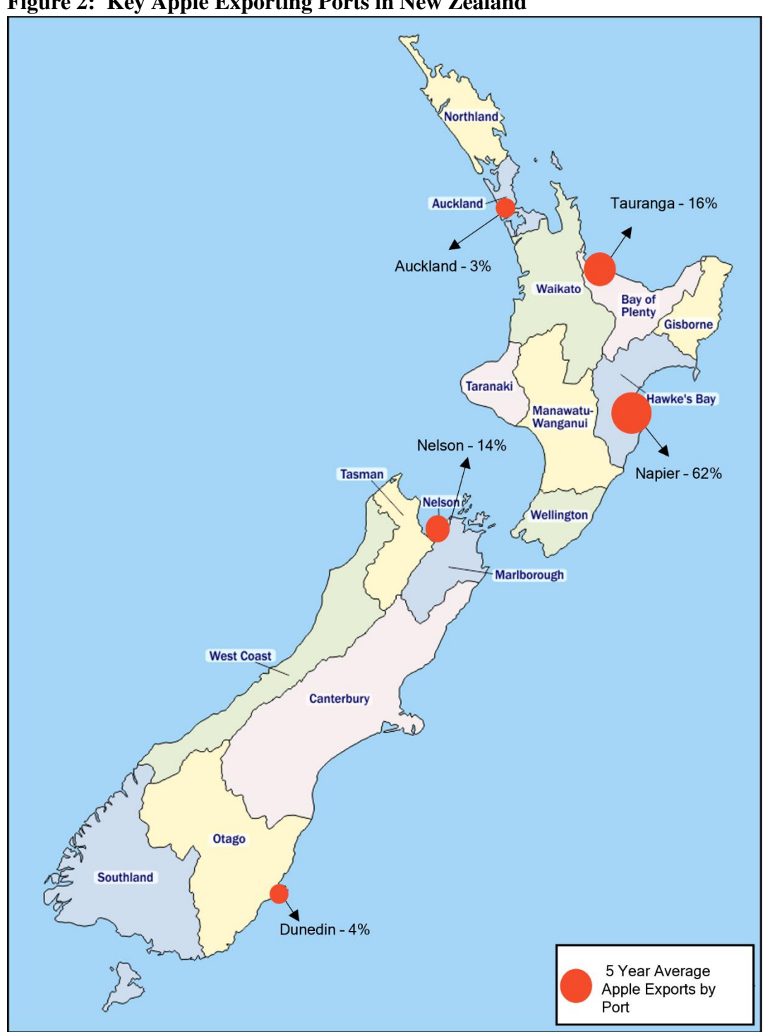
Figure 2: Key Apple Exporting Ports in New Zealand