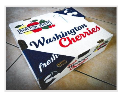
Local Imports of Washington Rainier Cherries