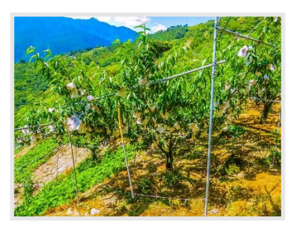
Local Production of Honey Peaches